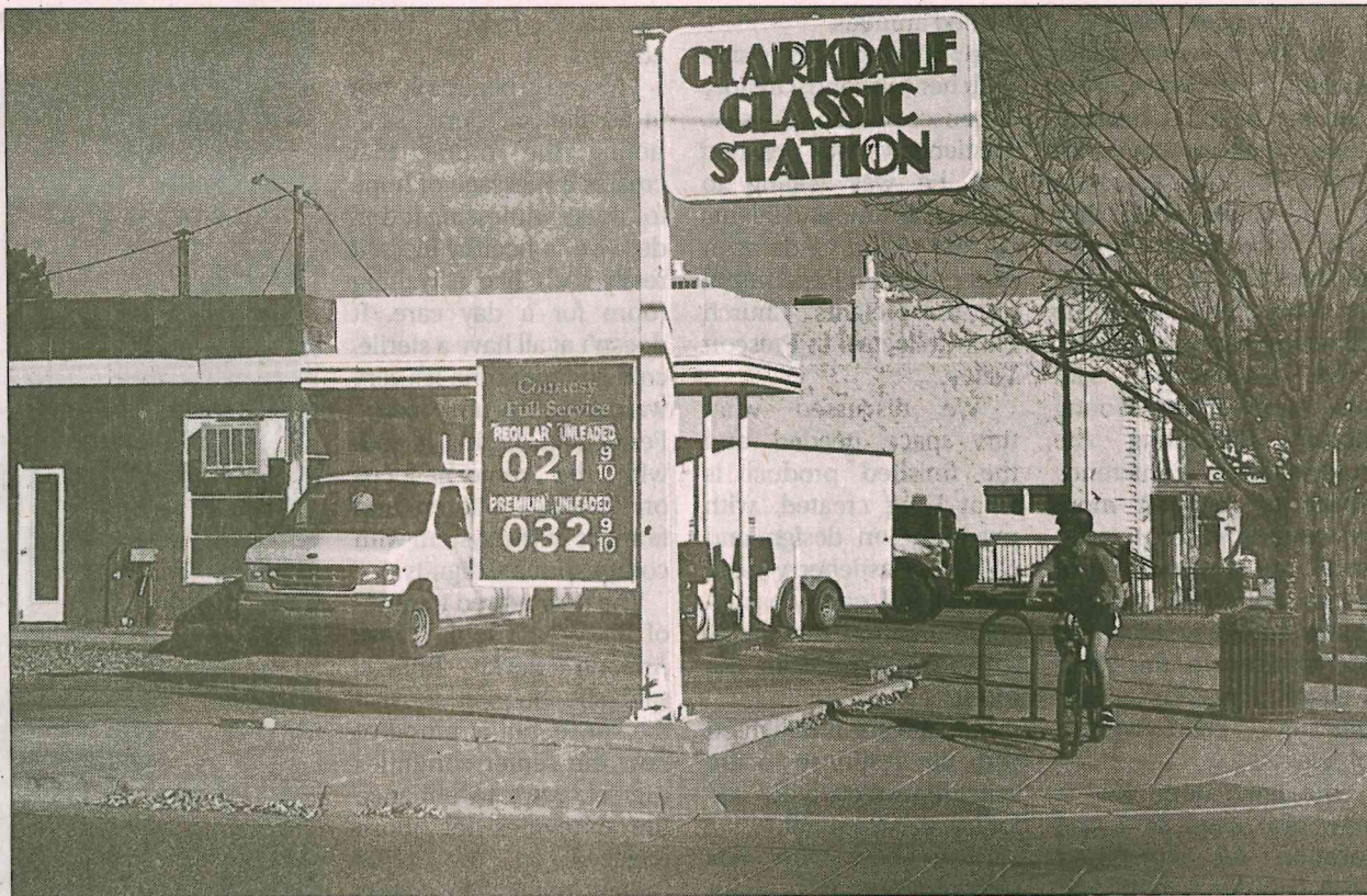
The historic Clarkdale Classic Station is undergoing a transformation with new design plans coming forward this year.